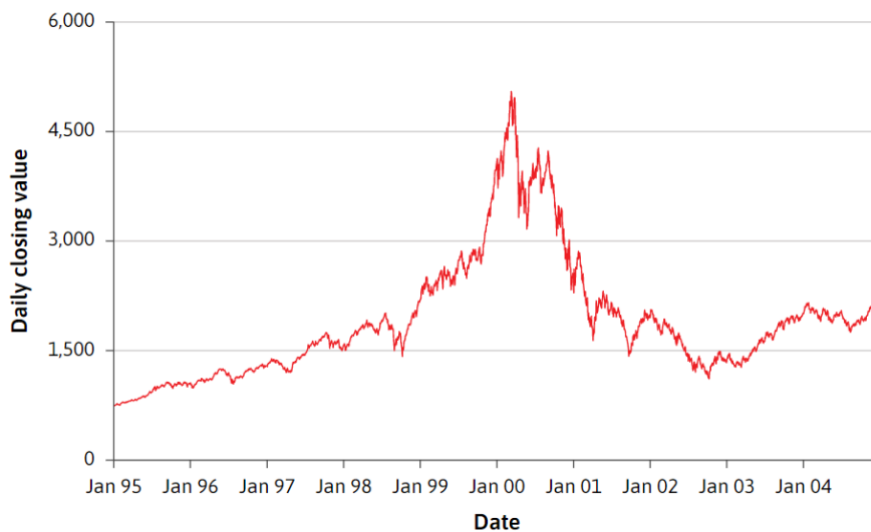
Figure 3.1 The tech bubble: Nasdaq Composite Index (1995–2004).

Share prices are not only volatile hour-by-hour and day-by-day. They can also display large swings, often referred to as bubbles. Figure 3.1 shows the value of the Nasdaq Composite Index between 1995 and 2004. This index is an average of prices for a set of stocks, with companies weighted in proportion to their market capitalization. The Nasdaq Composite Index at this time included many fast-growing and hard-to-value companies in technology sectors.